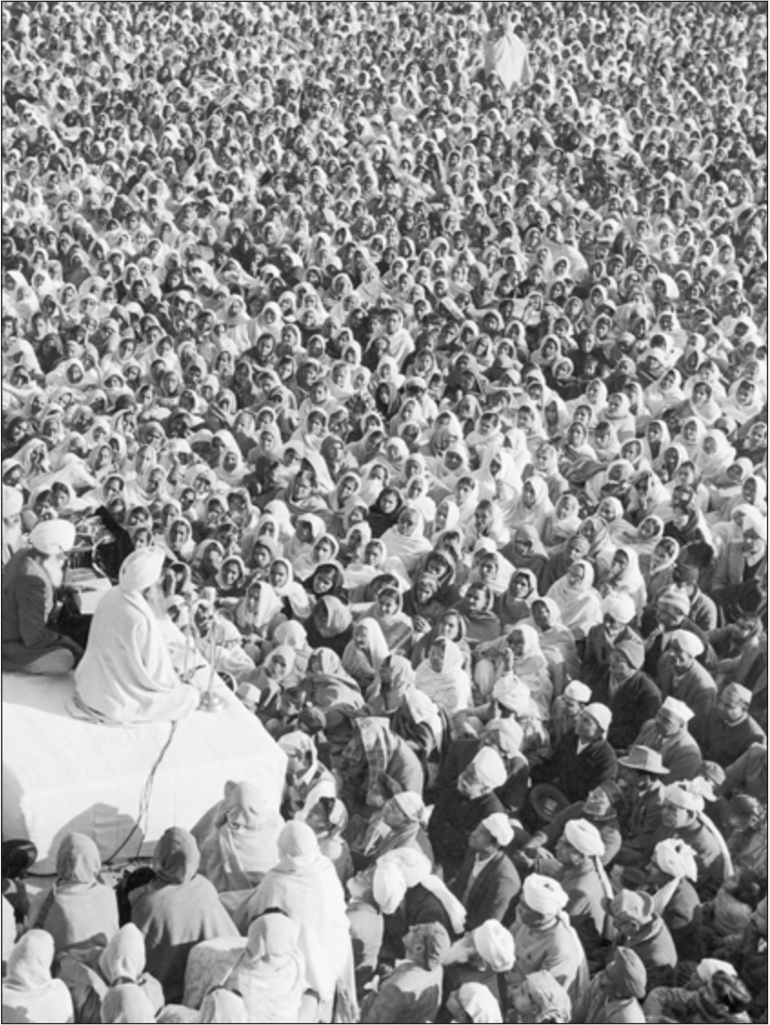
Maharaj Charan Singh